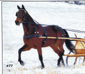
Cross Horse Pony Mini