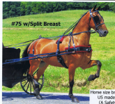
#75 w/Split Breast